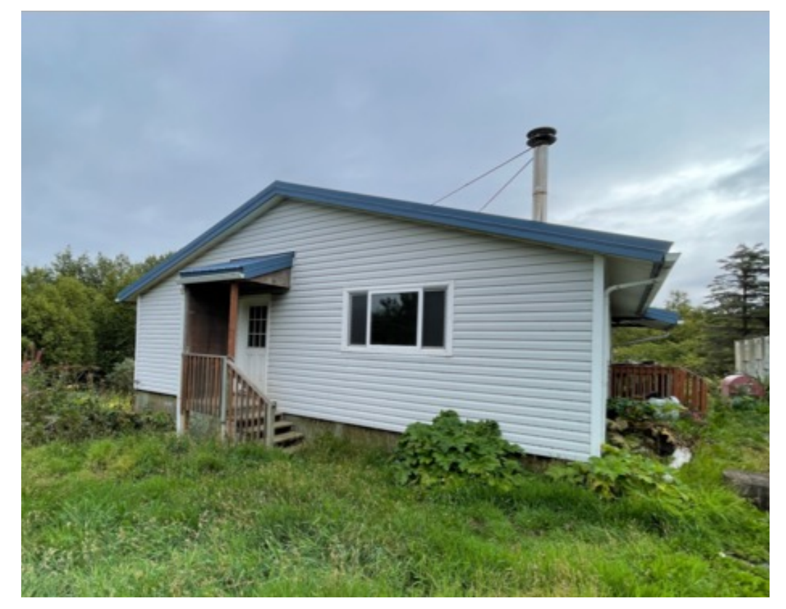
KIHA property in Larsen Bay